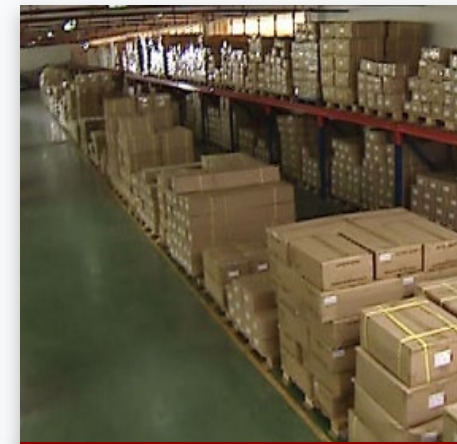
包装检测、运输 Packaging & Logistics