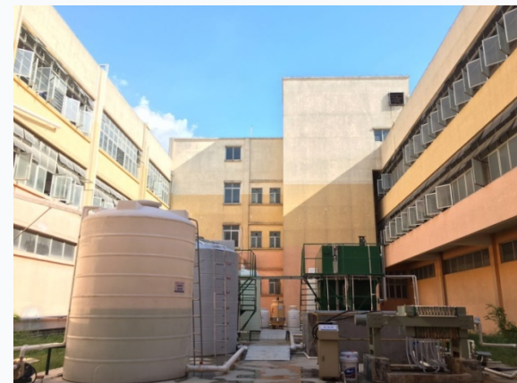
污水处理系统 Wastewater Treatment System