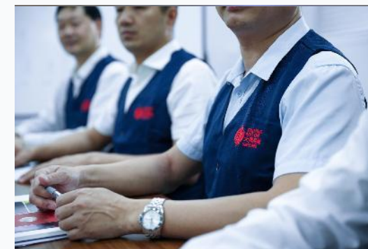
精英销售团队 Professional Elite Team