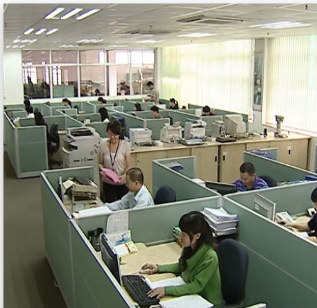
销售部接单 Sale Department