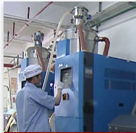
制程检测、成品检测 Quality Control